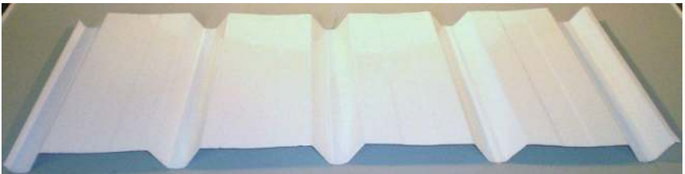
Underside - High Gloss Painted