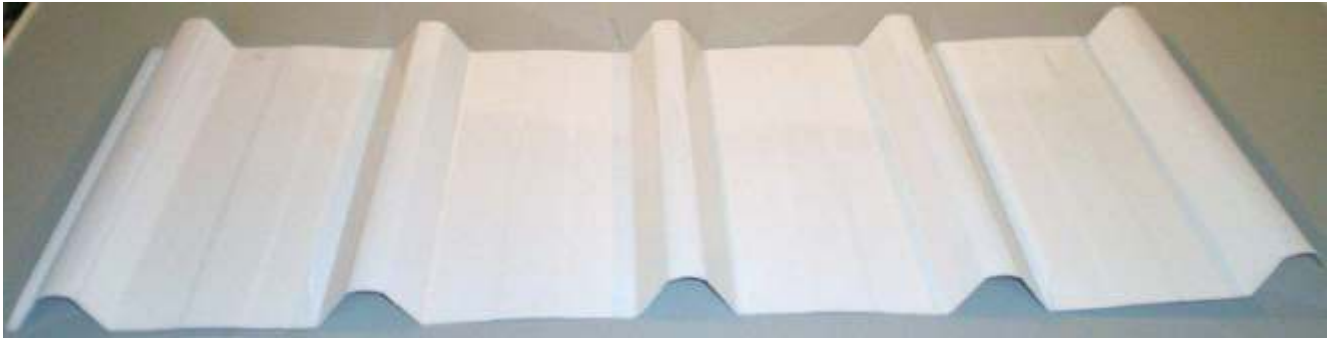
Topside - Satin Painted

0.42 mm B.M.T. Hi-Tensile Steel Paint - Colorbond Maximum Span - 1.9 mtr Sheet Cover - 762mm