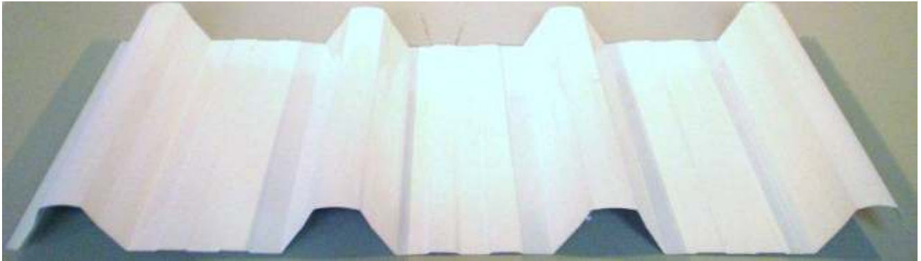
Topside - Satin Painted

0.42 mm B.M.T. Hi-Tensile Steel Paint - Colorbond Maximum Span - 3.2 mtr Sheet Cover - 650mm