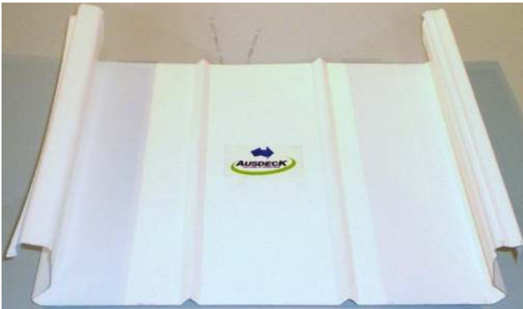
Topside - Satin Painted